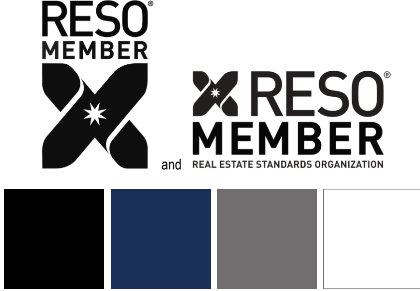
(logo is available in the colors above: #000000, #182f58, #726e70, #FFFFFF)

RESO members that are in good standing with RESO may use this logo in its entirety in the company's marketing materials, consistent with this Agreement. This logo cannot be used in context to particular systems or product offerings from the company. RESO charter members must not use the RESO Member Logo in a way creates a false association with any other product or company, or with RESO, as determined in RESO's sole discretion.