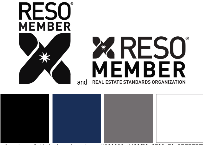
(logo is available in the colors above: #000000, #182f58, #726e70, #FFFFFF)

RESO members that are in good standing with RESO may use this logo in its entirety in the company's marketing materials, consistent with this Agreement. This logo cannot be used in context to particular systems or product offerings from the company. RESO charter members must not use the RESO Member Logo in a way creates a false association with any other product or company, or with RESO, as determined in RESO's sole discretion.